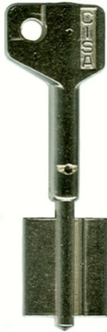
CISA Nº1 / Nº2 Ref. 00125-1 / 2 DTª / ESQª (5CS4T / 5CS3T)