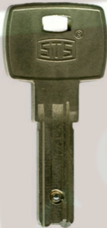
X-BOLA DM 139 (SILCA)