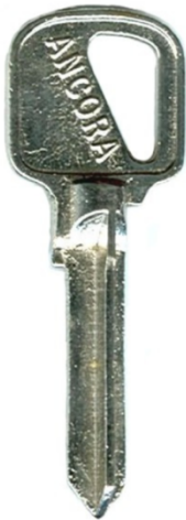
CCF 11 (ORIGINAL LONGA)