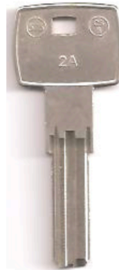
CS5 - 2A