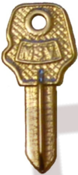
CCF 12 (CCF6)