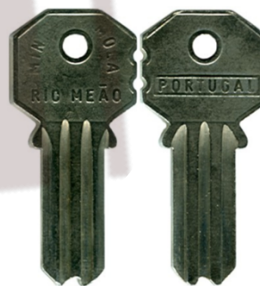
DUPLA MINI-MOLA DT a / ESQ a