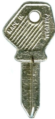
C4B (ORIGINAL CURTA) (C.C.F. 9)