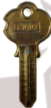
1956 - A