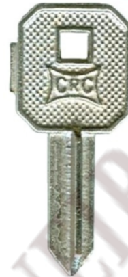
ORIGINAL (CCF2 / XC1)