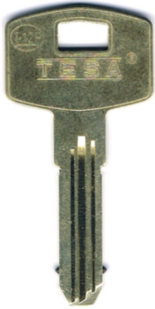
TESA - T12