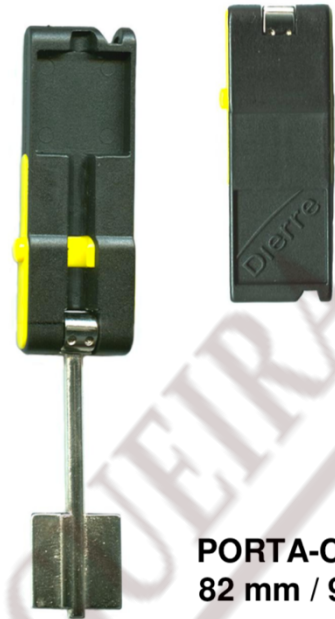
PORTA-CHAVE 82 mm / 96 mm